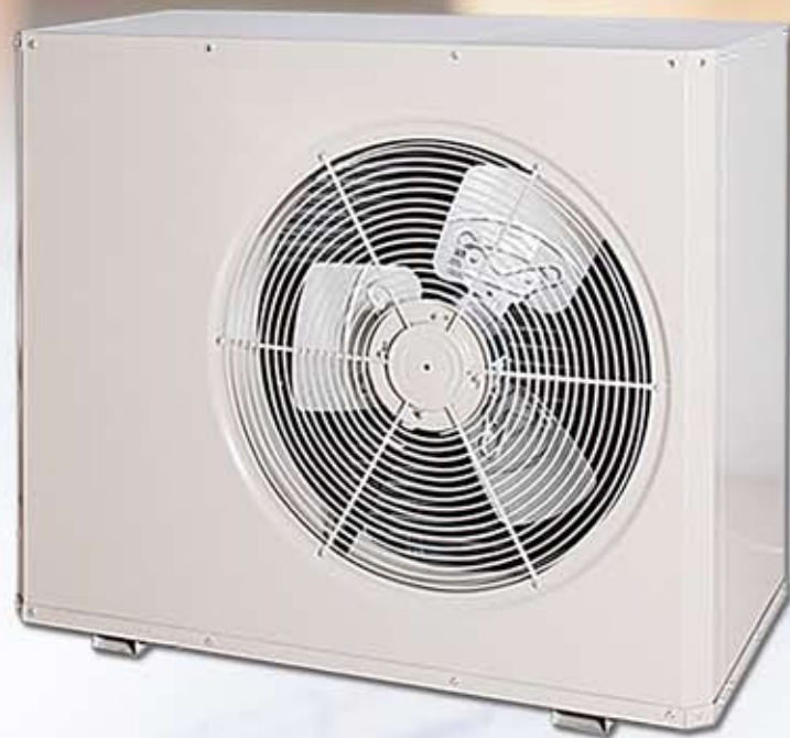
UNITS FROM 36000 TO 60000 BTU